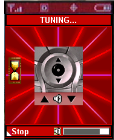
Figure 4 Linked Station Tuning

The up and down keys can be used to preset low or high volume. The CLR and the Stop (top-left) key can be use to stop the tuning and return to the applications menu, and the END key can be used to exit to the phone idle screen.