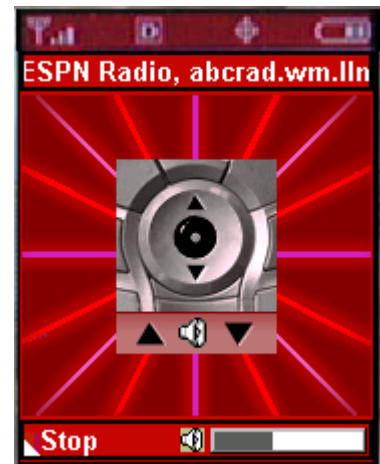
Figure 6 Playing a Linked Radio Cast

The Up and Down arrow keys will allow you to set the volume. The CLR and the Stop (top-left) key can be used to return to the applications menu, and the END key can be used to exit to the phone idle screen.