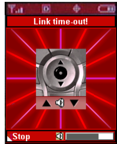
Figure 5 LinkTime-out

The CLR and the Stop (top-left) key can be used to return to the applications menu, and the END key can be used to exit to the phone idle screen.